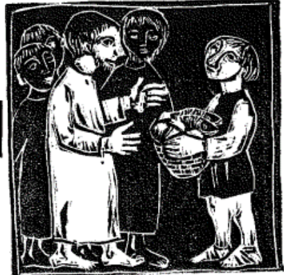
The Concluding Rites

THERE IS A LAD WHO HAS 5 BARLEY LOAVES JN 6:9